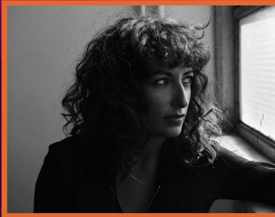
ROSI GOLAN | musical guest